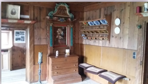
Altar at the Sala

Two things caught my attention. First. The “Angelus” which stresses the mystery of the Incarnation was very dear to the family. That was a counterpart of the strong devotion of Arnold Janssen’s family to the Word made flesh. While the Freinademetz family recited the Angelus daily, the Janssen family used to read the Prologue of John’s Gospel. Before Joseph and Arnold met in 1875, they were already sharing something in common – devotion to the Incarnate Word of God. Later on, they were united to do mission in the Divine Word.