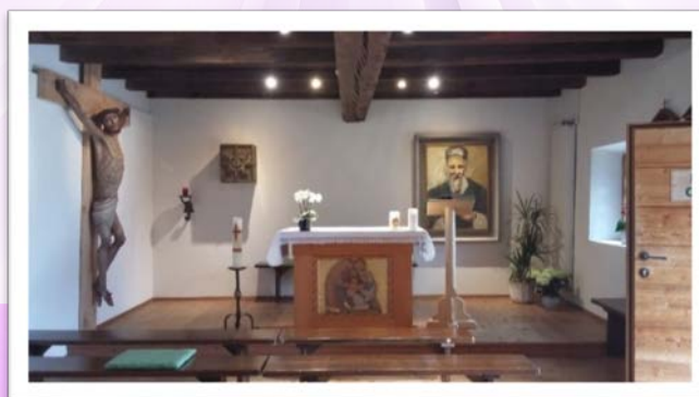
Chapel in the house