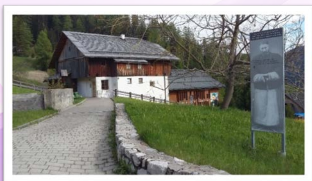
St. Joseph House