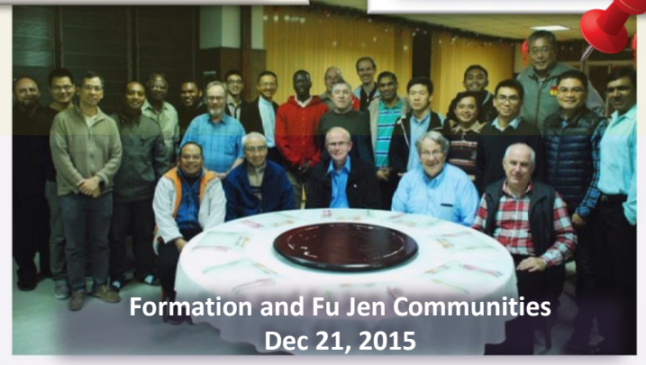
Formation and Fu Jen Communities Dec 21, 2015