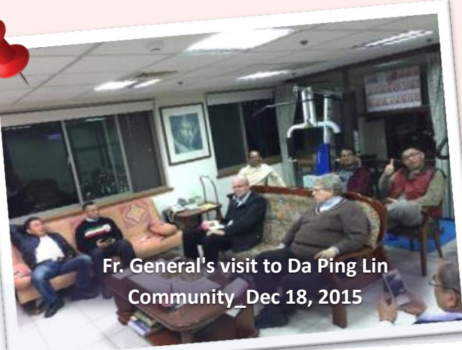
Fr. General's visit to Da Ping Lin Community_Dec 18, 2015