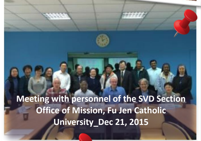
Meeting with personnel of the SVD Section Office of Mission, Fu Jen Catholic University_Dec 21, 2015