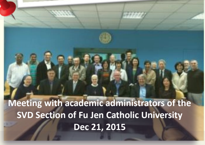
Meeting with academic administrators of the SVD Section of Fu Jen Catholic University Dec 21, 2015