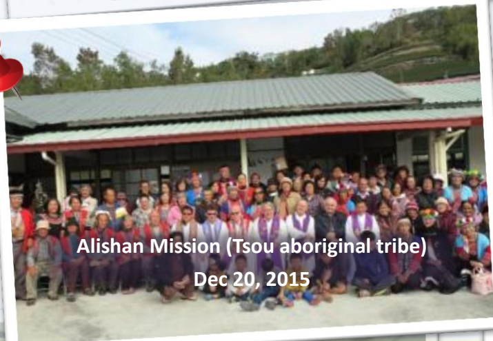
Alishan Mission (Tsou aboriginal tribe) Dec 20, 2015