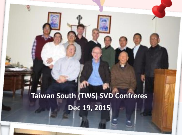
Taiwan South (TWS) SVD Confreres Dec 19, 2015